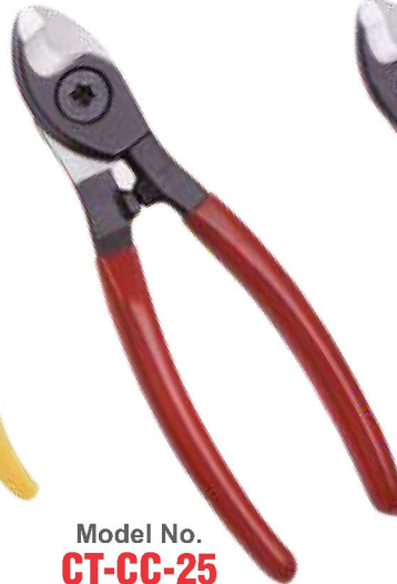
Model No. CT-CC-25