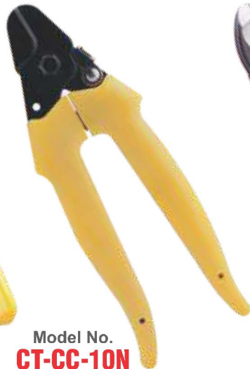
Model No. CT-CC-10N