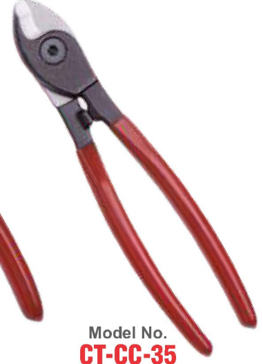
Model No. CT-CC-35