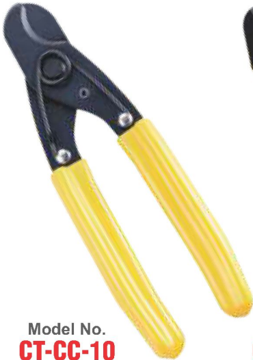
Model No. CT-CC-10