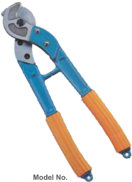
Model No. CT-CC-240

Capacity : upto 240Sq.mm Weight : 1.5 kg. (Higher models available on request)