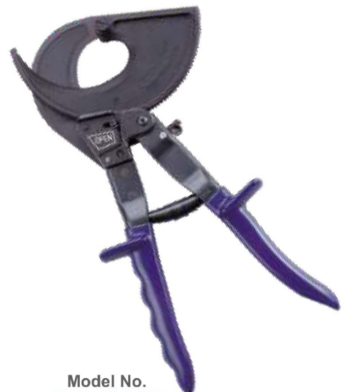
Model No. CT-RC-500

Capacity : upto 400Sq.mm Weight : 1.6 kg.