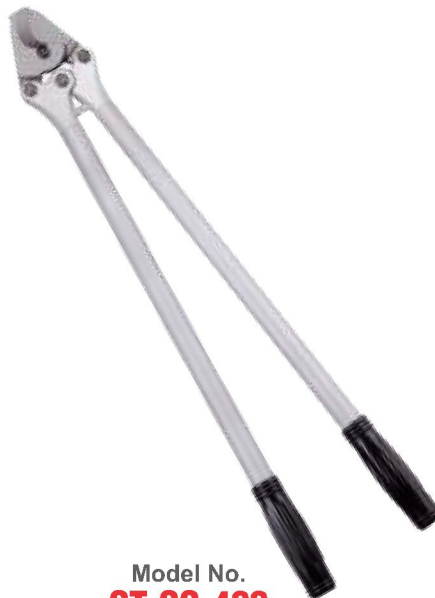
Model No. CT-CC-400

Capacity : upto 240Sq.mm Weight : 1.5 kg. (Higher models available on request)