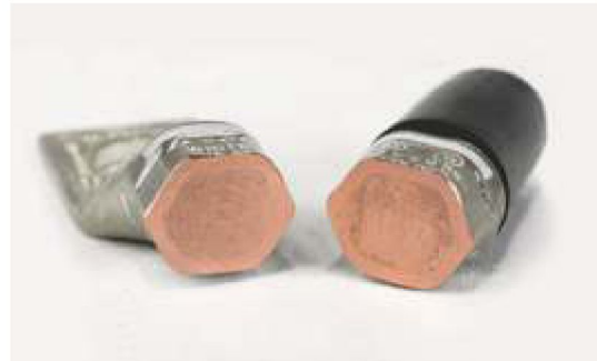
Hexagonal Crimp Profile