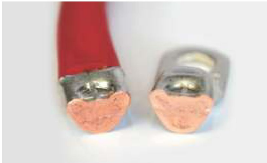
Indent Crimp Profile

Hexagonal type the most common type of crimp, create strong mechanical connections. The advantage of this style crimp is that force is applied consistently from all directions over a larger area during crimping, preventing any damage to the conductors. This style crimp is an industry standard for aluminum and copper cables up to 1000mm 2 . Hex-style crimps yield superior electrical performance in addition to great pullout strength.