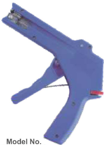
Model No. CT-TT-48P

Capacity : 25mm to 36mm Dia. Weight : 150 g