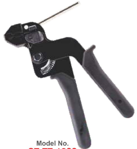
Model No. CT-TT-13SS

Capacity : Tie width upto 4.8mm Weight : 200 g