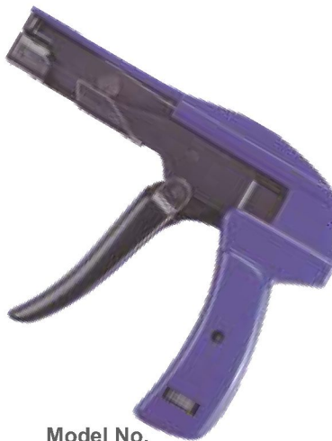
Model No. CT-TT-48M

Capacity : Tie width upto 4.8mm Weight : 200 g