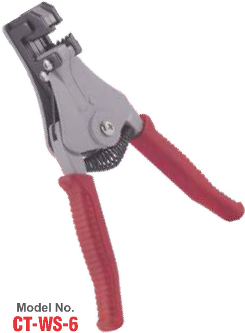
Model No. CT-WS-6