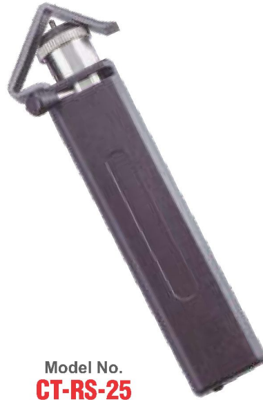
Model No. CT-RS-25

Capacity : 4mm to 25mm Dia. Weight : 150 g