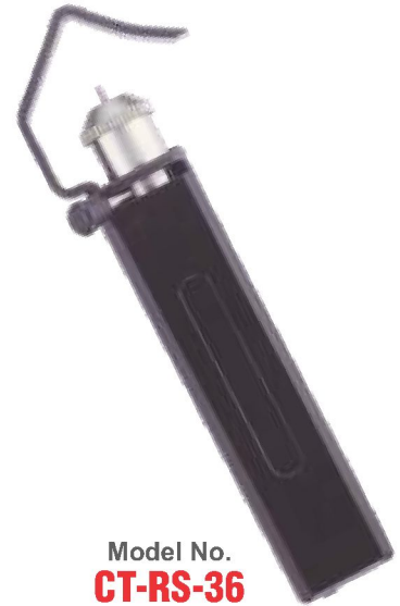
Model No. CT-RS-36

Capacity : 4mm to 25mm Dia. Weight : 150 g